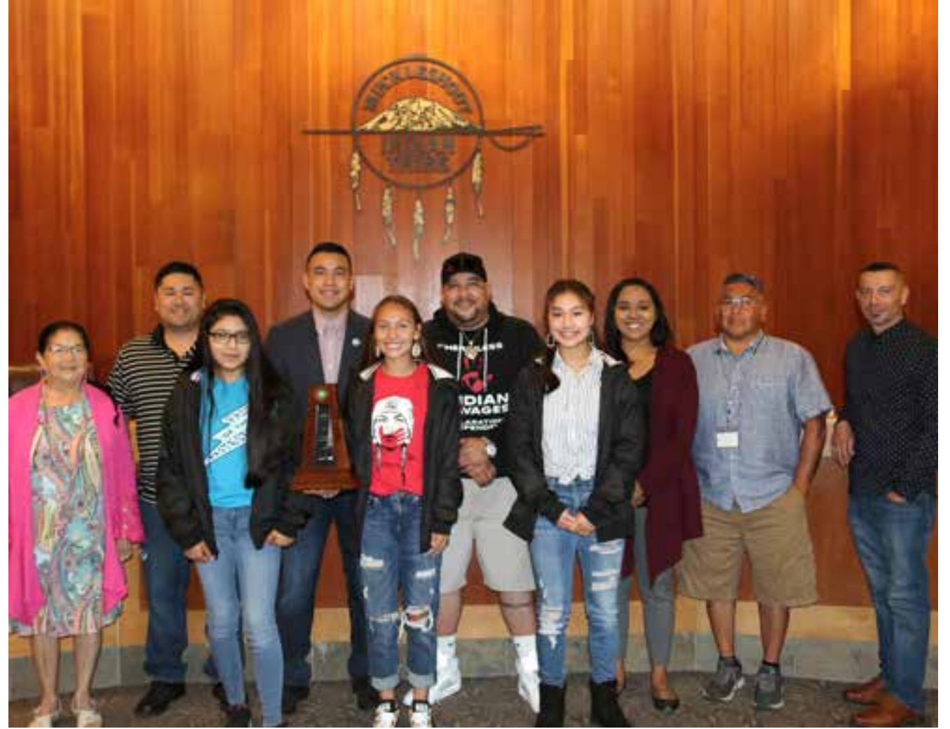
Muckleshoot Kings Girls Track Team Honored by Tribal Council, June 21, 2019