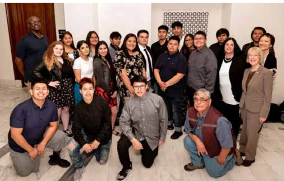
Sen. Patty Murray, on right, met with students and staff of MTS and VCNEC during their Washington DC trip.