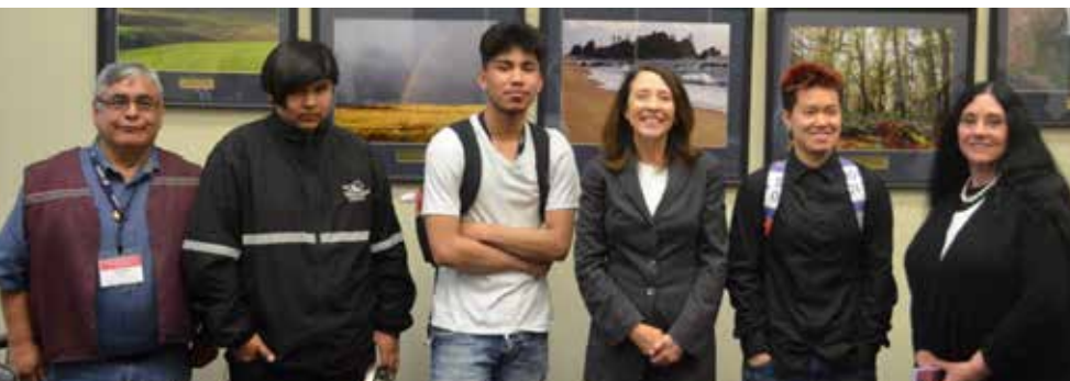
Students and staff of Virginia Cross Native Education Center with Sen. Maria Cantwell in Washington DC